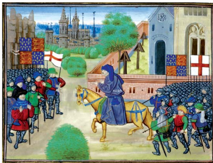
John Ball, mounted, preaching to the peasant 'army'. Wat Tyler, left, is in the black hat. From a contemporary manuscript in the Public Domain.