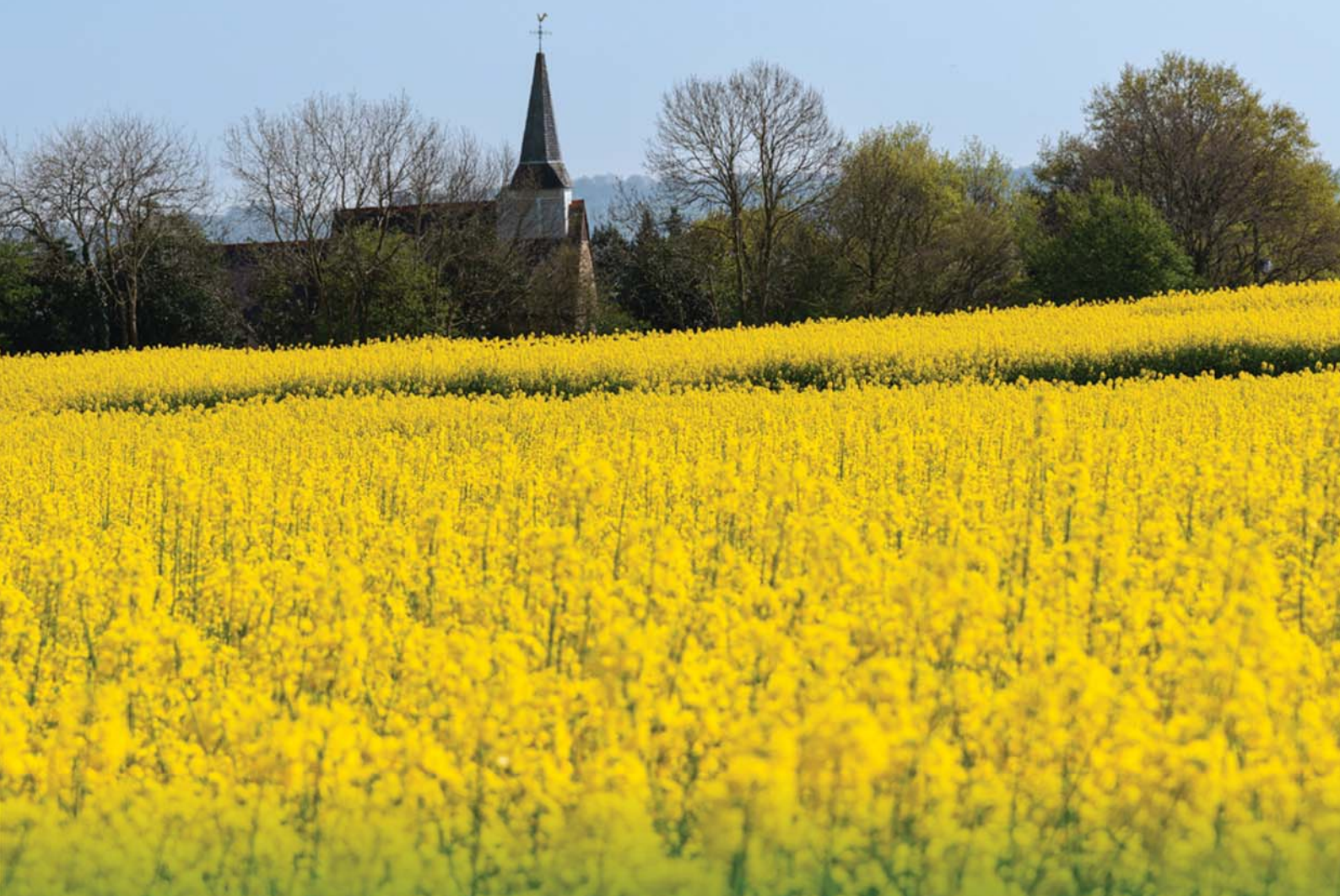
St Mary the Virgin at Little Burstead

Don't forget – The BDRA Annual General Meeting – 21st May PAGE 2