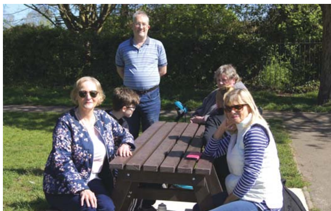
Members of the BDRA Committee inspecting the picnic bench for wheelchair users, purchased by FOLM with a donation given on behalf of our members. (See FOLM article page 6)

This location was muted for development as long ago as 2013, and as recently as last year the land agent held a consultation on their plans. No doubt emboldened by the Government's relentless focus on house building, changes to national planning policies making it easier to get planning permission, and the recent approvals of other Green Belt developments around Billericay, it is not surprising that this new application has come to light. Sadly, we don't think it will be the last with developments on Outwood Common Road and Southend Road being considered. Our Green Belt is in danger of becoming grey! To keep up to date with planning matters please follow the Billericay Action Group on their Facebook group 'Save Billericay From Housing Developments'.